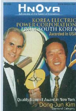
B.I.D. IQS Award winner, in New York, KEPCO, on the cover of HNOVA Magazine