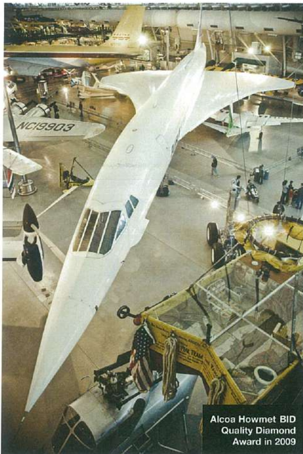
Alcoa Howmet BID Quality Diamond Award in 2009